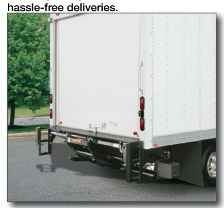
C Series Gate in stowed position.

Reduced maintenance and original Flipaway design means smoother,